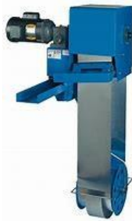
Belt Skimmer Filtration Unit