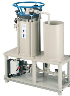
Paper Style Disc