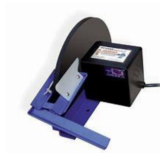
Disc Skimmer Filtration Unit