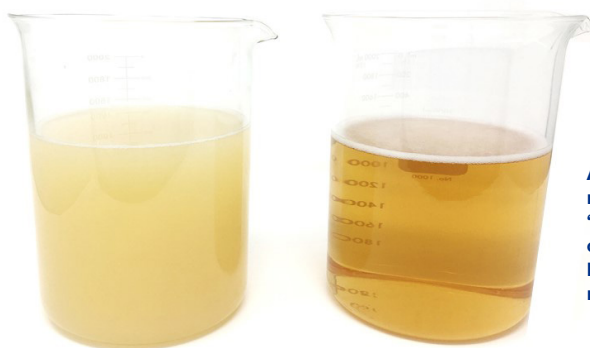
Aquaease® Infinity cleaners retain their efficacy. Left: A “ready to dump” oil saturated cleaner. Right: Aquaease Infinity cleaner after the membrane process.

Total savings after lease is factored in: $37,300 (lease cost is $2,200/month)