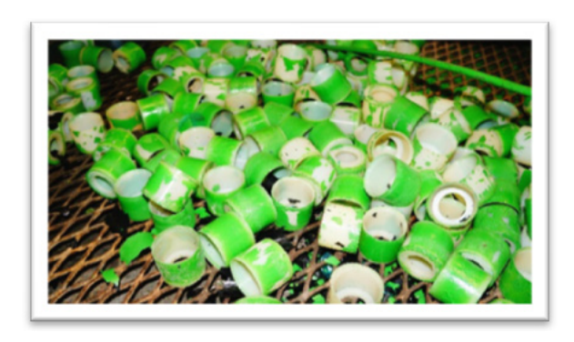
Reuse masking plugs up to 6-7 times before throwing away.

Hubbard-Hall's process experts mapped out an affordable turnkey system that solved a problem the customer didn't even realize they had! The recommendations included a proper tank, filtering system, circulation, heating and baskets and, of course, our Aquastrip ACB.