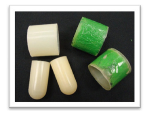
Save up to 85% on annual masking materials by stripping and reusing with Aquastrip ACB.

Add it up...How much do you spend on masking materials every year? It could easily be between $5,000 to $50,000, or more. Although the use of these materials is necessary, they offer little additional value to your products and are simply an expense.