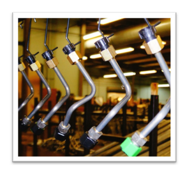
Threaded flange caps placed on tubes prior to powder coating: a necessary step to ensure no coating in unwanted areas.

Aquastrip ACB is a mildly acidic liquid concentrate, used to remove tenacious polymeric coatings including epoxy paints from ferrous and non-ferrous metals.