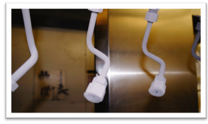
No need to throw away used flanges, covered in coating. Simply remove and strip for reuse.