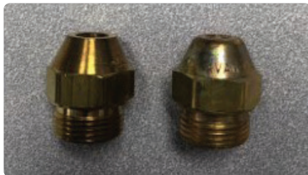
Left: Brass nozzle, before

With Hubbard-Hall chemistry, the company no longer needs to bright dip in nitric acid and follow with a chromate sealer to protect the nozzles from oxidizing after bright dip. Parts are now processed in Aquaease 2289 and sealed with Laser HFP, resulting in brighter nozzles that are pit-free. The company has switched over to a better, safer, and faster process.