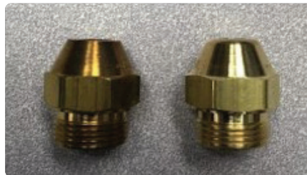
Left: Brass nozzle, before.